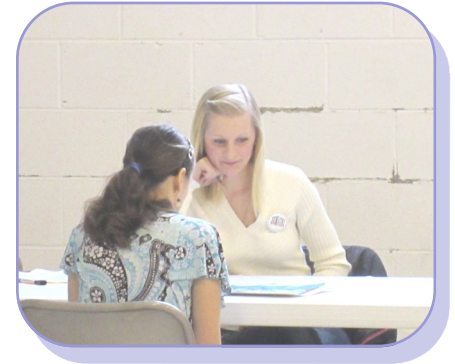
Interviews at Winter Achievement help 4-H'ers gain important life skills.